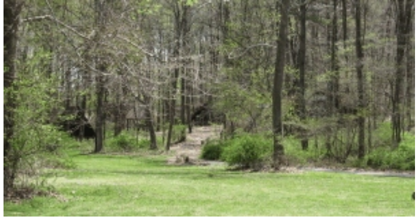
Can you see the screen houses nestled in there?

The morning daylight revealed the beauty of the site, Bright grey clouds overcast the soggy green field, and dark wooden buildings rested on the rolling green grassy hills... and quite a few strikingly bright flowered trees punctuated the winter brown trees that were just beginning to tip with the green buds of Spring.